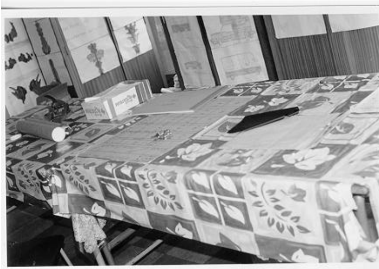
➤ Principal's office at Mandlakaba Primary School