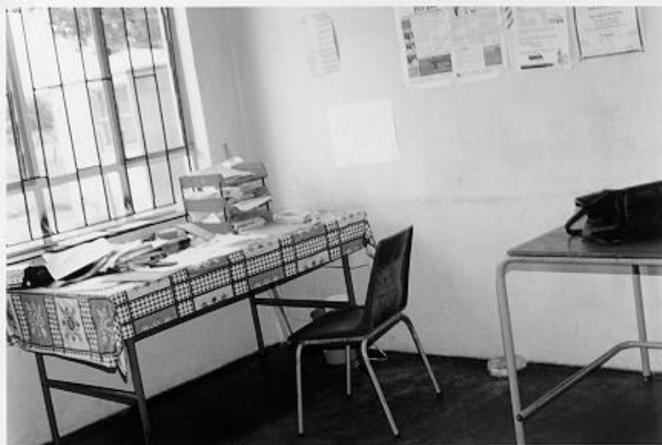
➤ Clerk's office at Mandlakababa Primary School