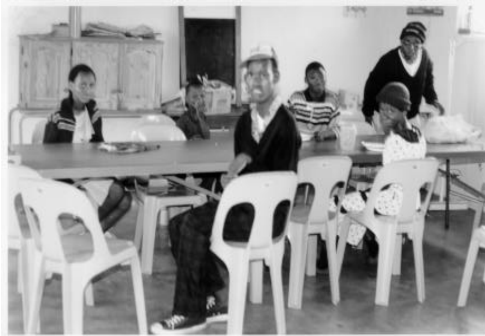
➤ Learners at Busisiwe Day Care Center, Kameelrivier A

The Busisiwe Day Care Centre at Kameelrivier A is also a project meant to help learners with various disabilities. Currently the center has 14 learners. Learners here are also taught basic literacy. The intention is also to train learners in various skills but this has not started because there are no sufficient funds to buy necessary equipment.