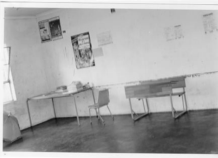
Staff room at Mandlakababa Primary School.