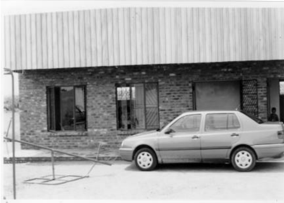
➤ This building, was donated to the Busisiwe Day Care people by the National Nutrition Support Programme in 1986.